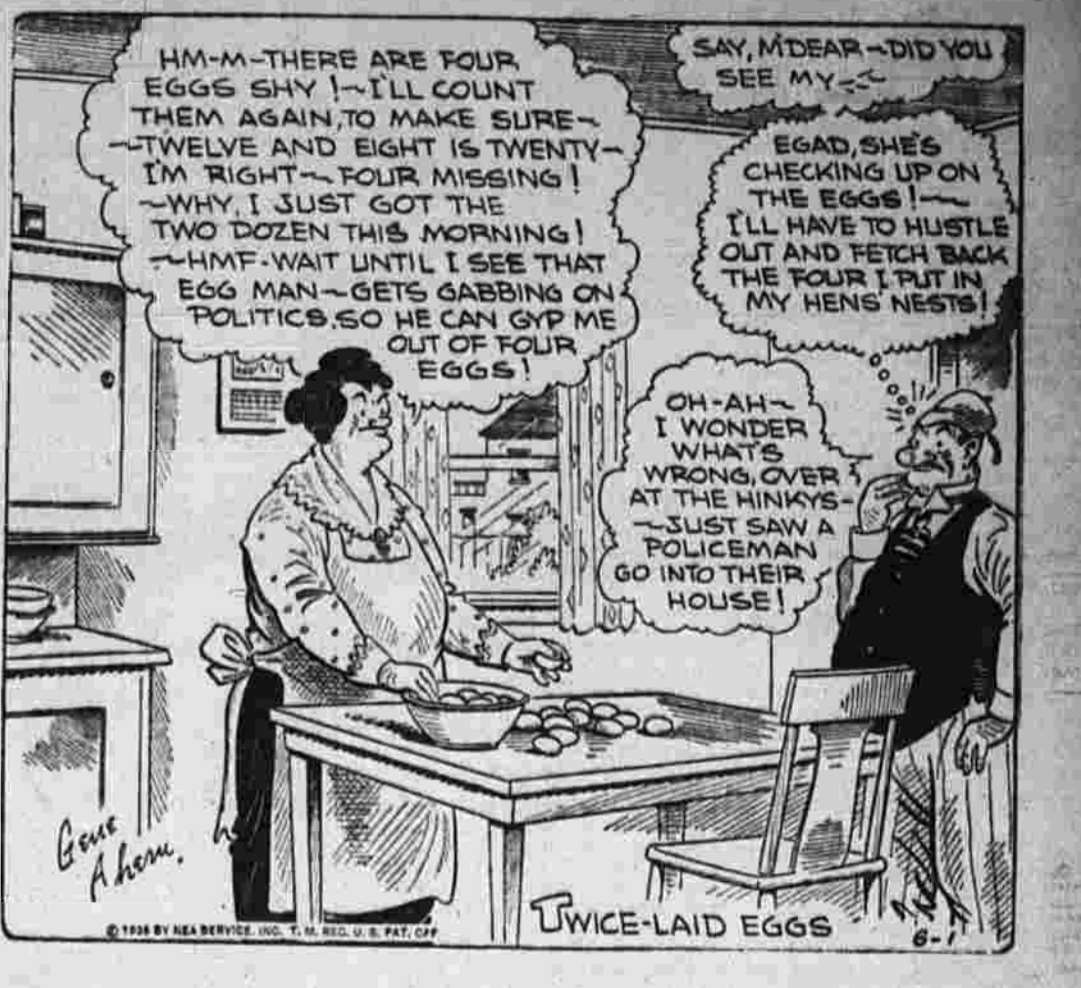
HM-M-THERE ARE FOUR EGGS SHY I'LL COUNT THEM AGAIN TO MAKE SURE—TWELVE AND EIGHT IS TWENTY—WHY I JUST GOT TWO DOZEN THIS MORNING!